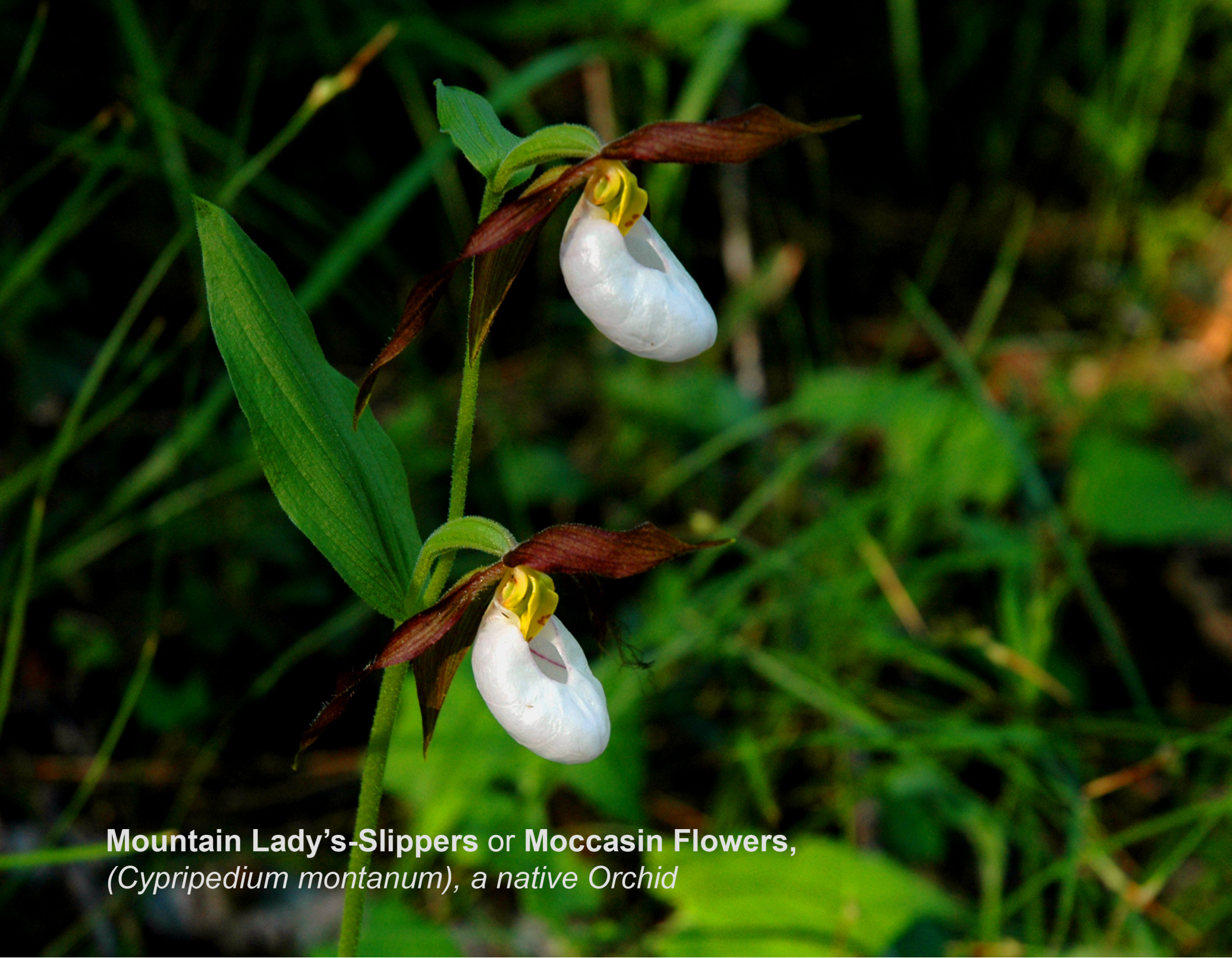
Mountain Lady's-Slippers or Moccasin Flowers, (Cypripedium montanum), a native Orchid