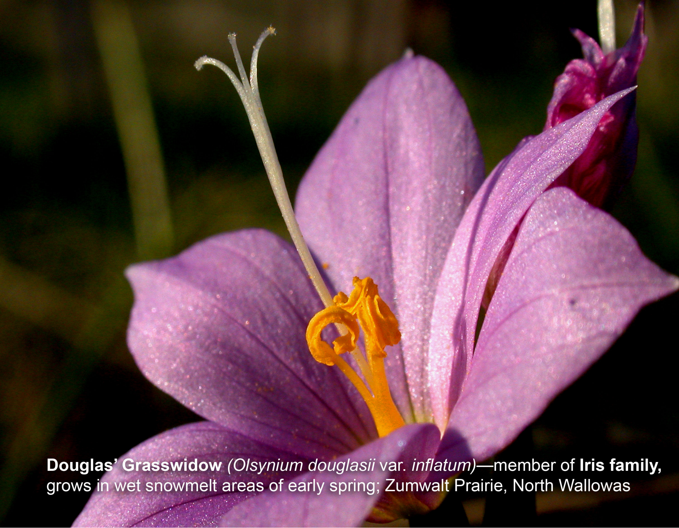
Douglas' Grasswidow ( Olsynium douglasii var. inflatum )—member of Iris family , grows in wet snowmelt areas of early spring; Zumwalt Prairie, North Wallowas