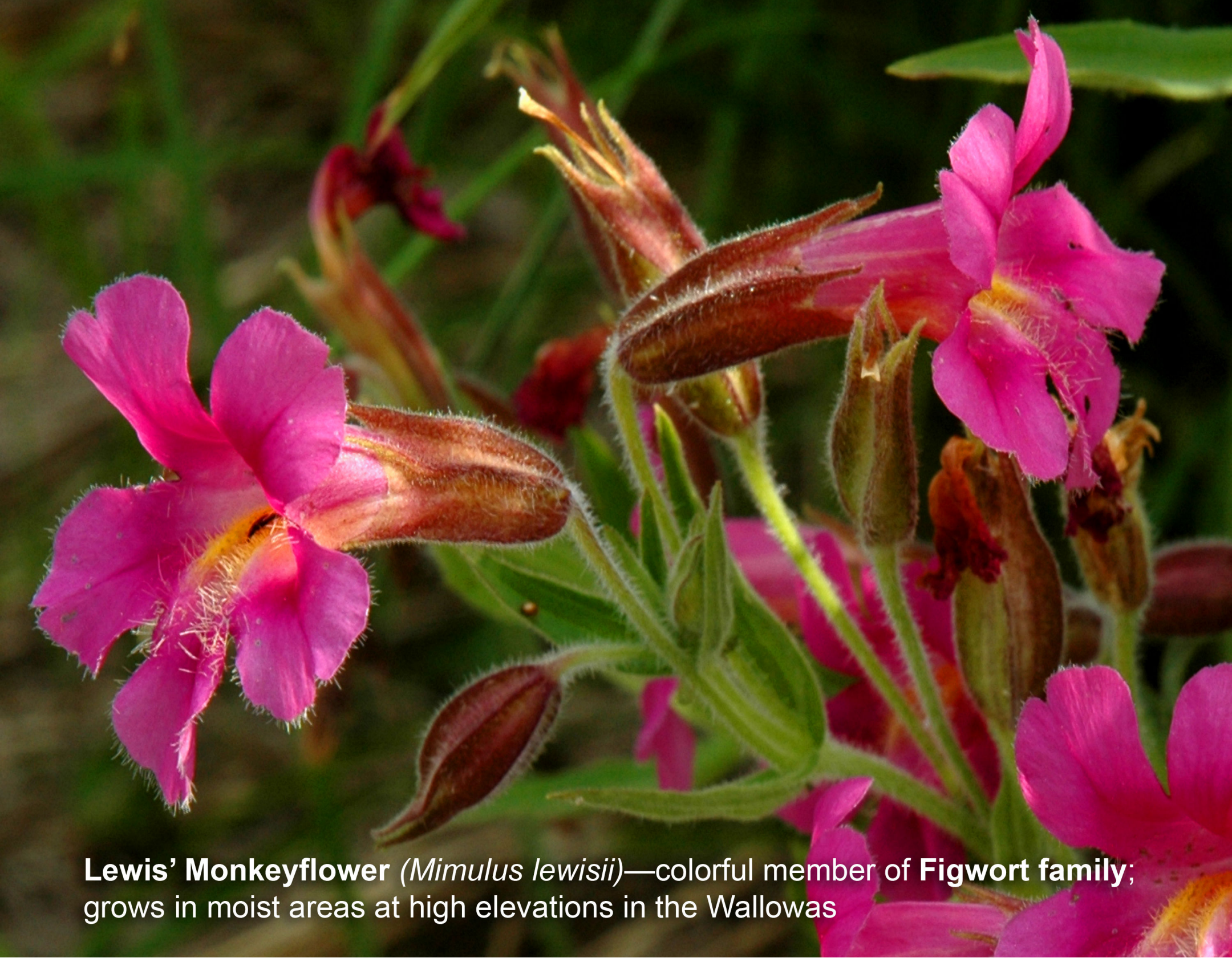
Lewis' Monkeyflower ( Mimulus lewisii )—colorful member of Figwort family ; grows in moist areas at high elevations in the Wallowas