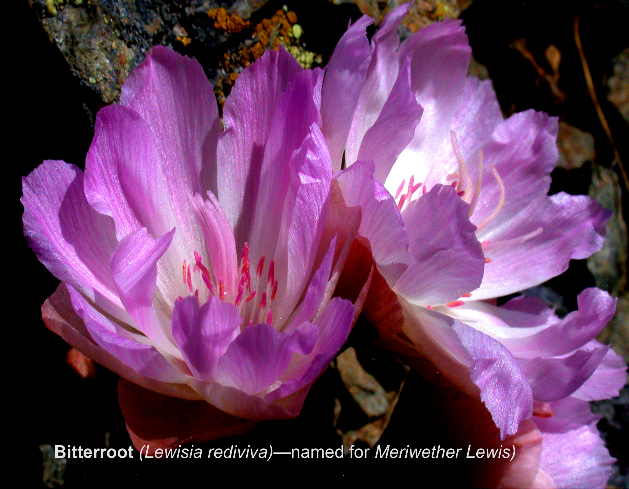
Bitterroot ( Lewisia rediviva )—named for Meriwether Lewis