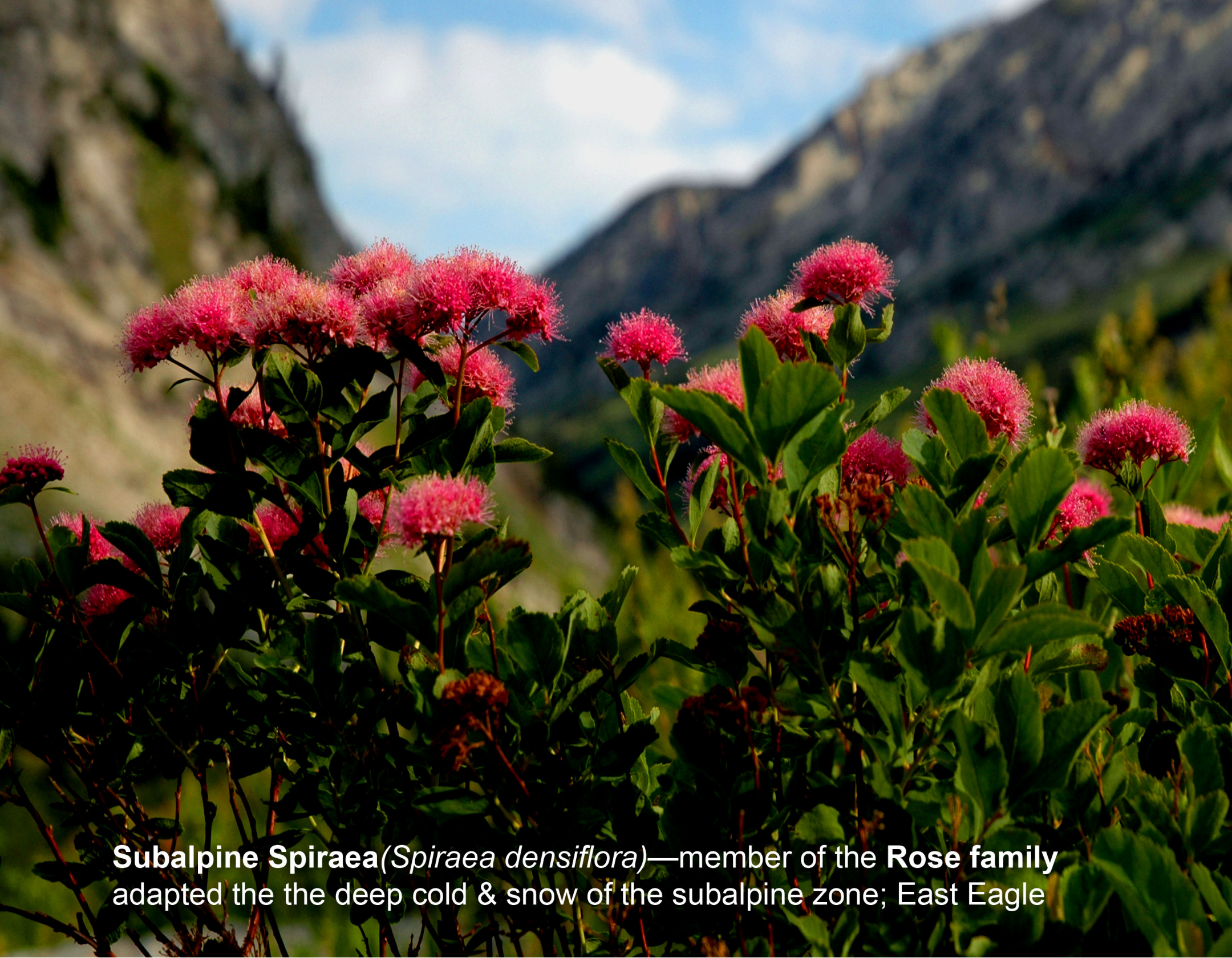
Subalpine Spiraea ( Spiraea densiflora )—member of the Rose family adapted to the deep cold & snow of the subalpine zone; East Eagle