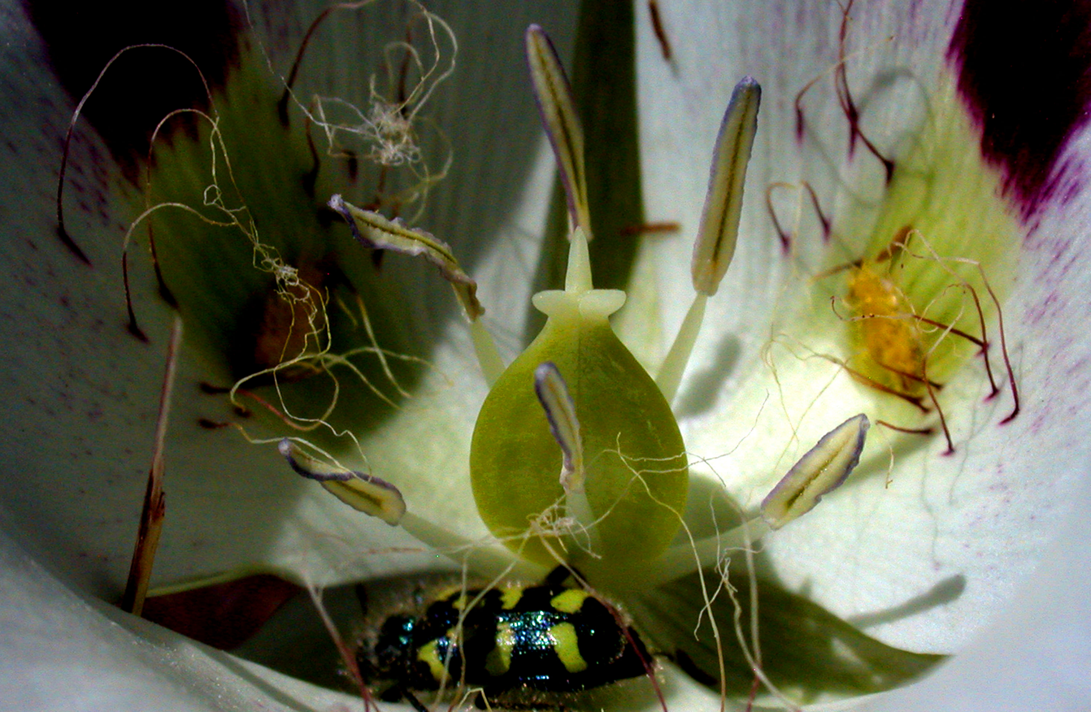
Wing-fruited Mariposa Lily, close-up ( Calochortus eurycarpus )—closely related to Sego Lily ; Native Americans taught early pioneers how to use the bulbs like small potatoes, raw or roasted; orange bands are the nectaries