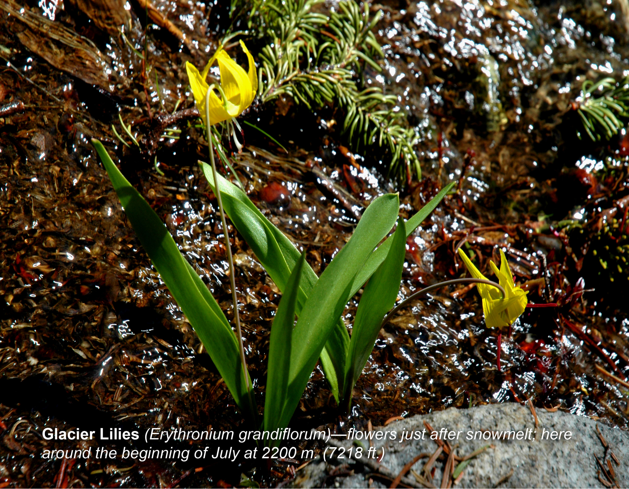
Glacier Lilies ( Erythronium grandiflorum )—flowers just after snowmelt; here around the beginning of July at 2200 m. (7218 ft.)