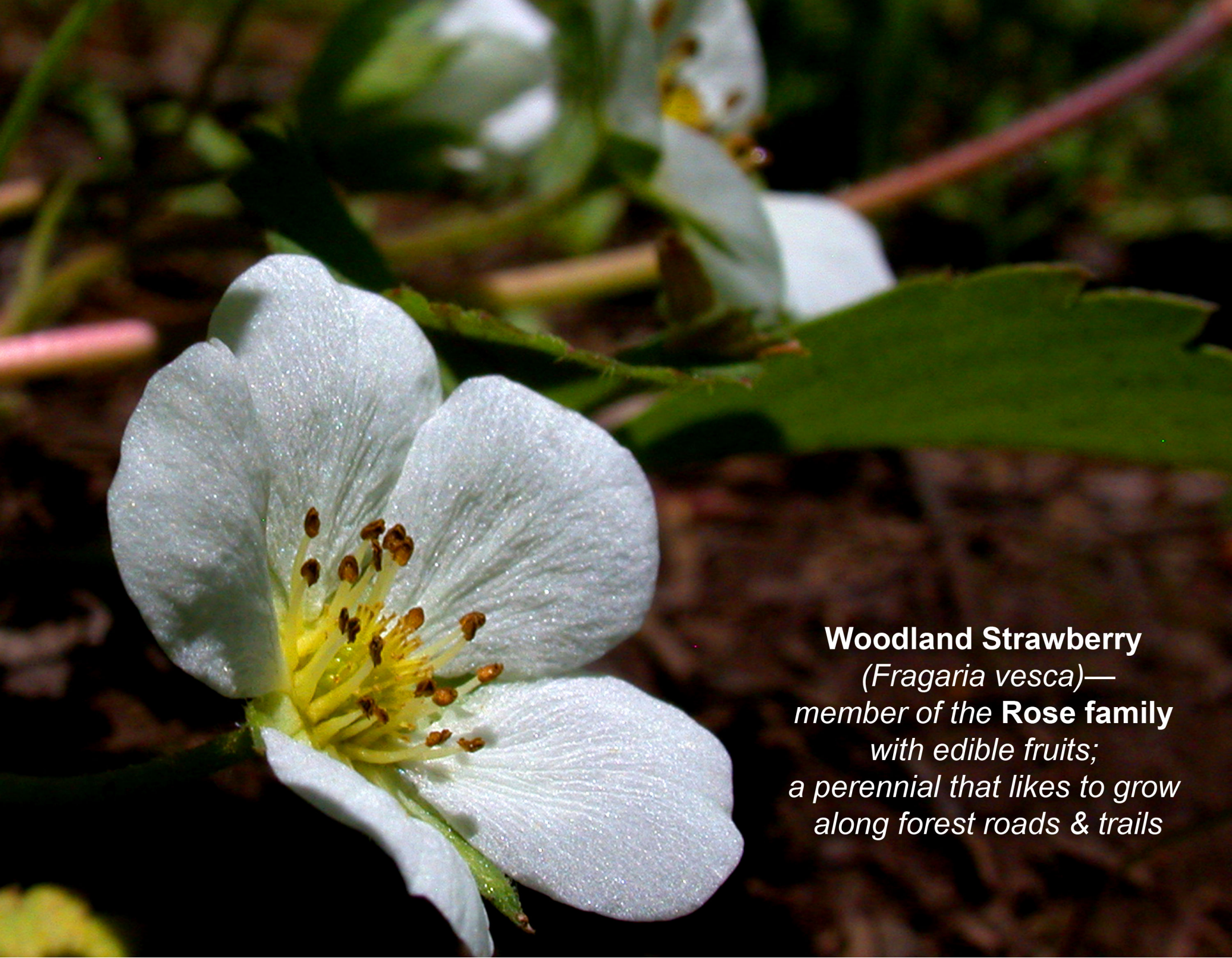
Woodland Strawberry ( Fragaria vesca )— member of the Rose family with edible fruits; a perennial that likes to grow along forest roads & trails