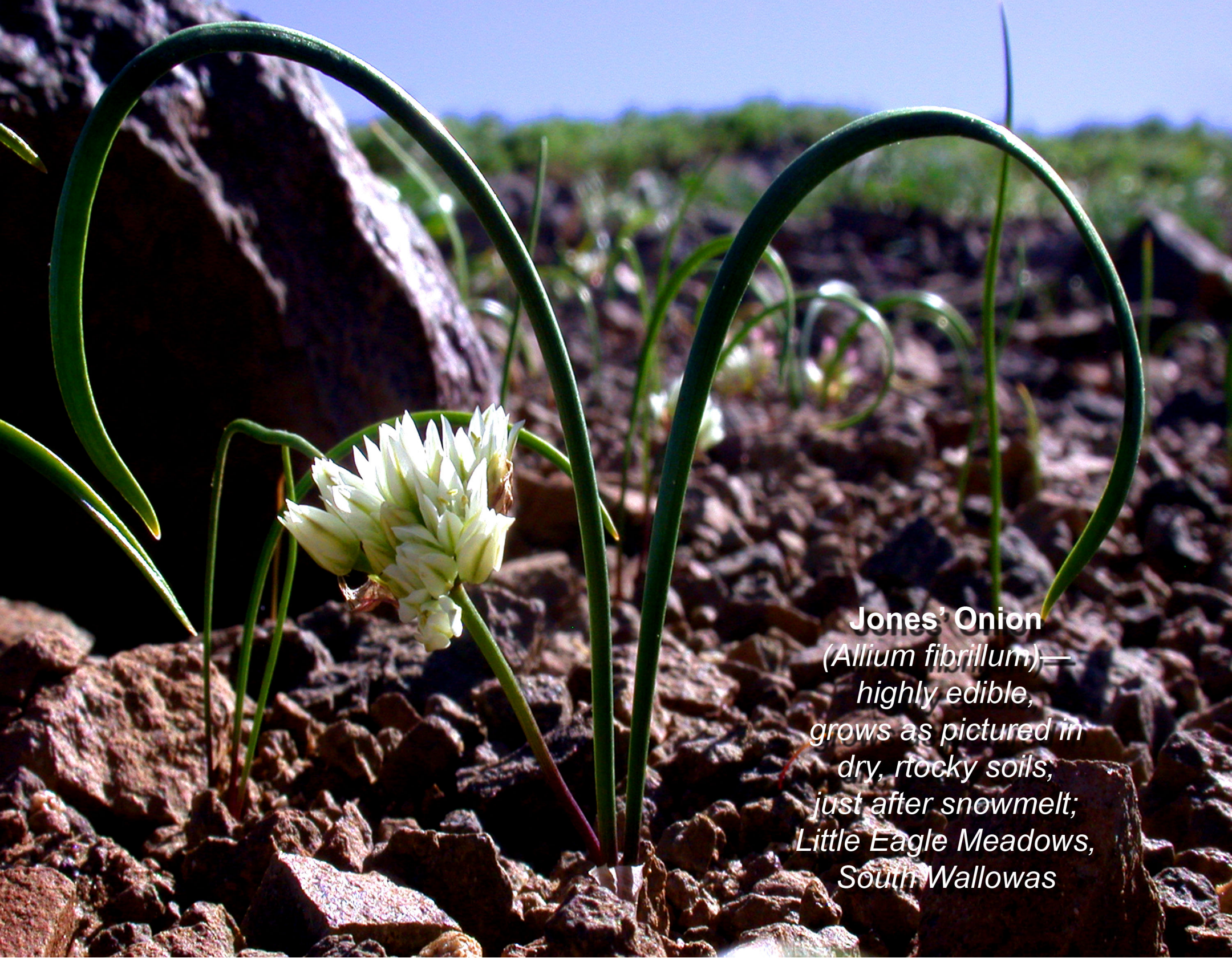
Jones' Onion ( Allium fibrillum )— highly edible, grows as pictured in dry, rocky soils, just after snowmelt; Little Eagle Meadows, South Wallowas