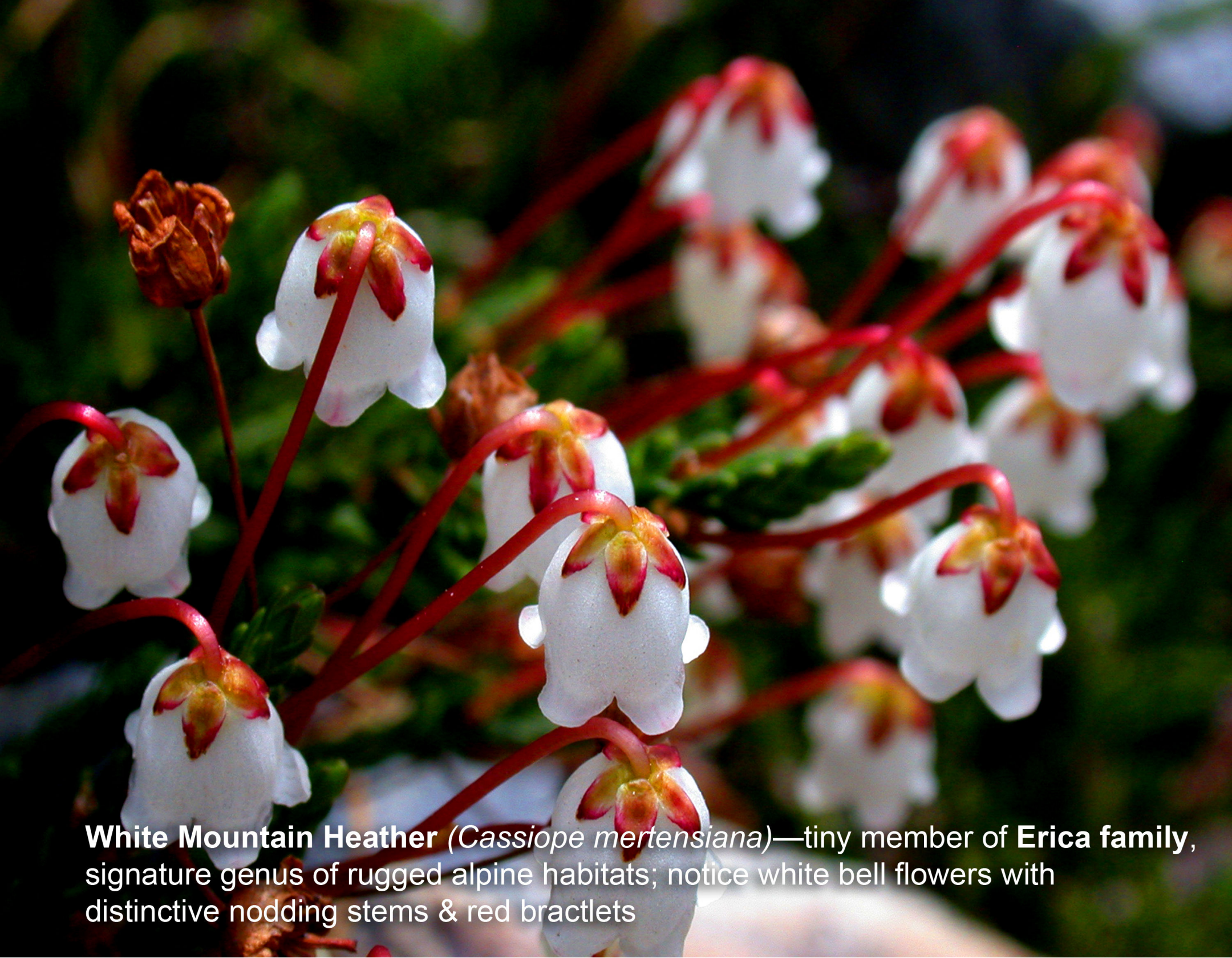
White Mountain Heather ( Cassiope mertensiana )—tiny member of Erica family, signature genus of rugged alpine habitats; notice white bell flowers with distinctive nodding stems & red bractlets