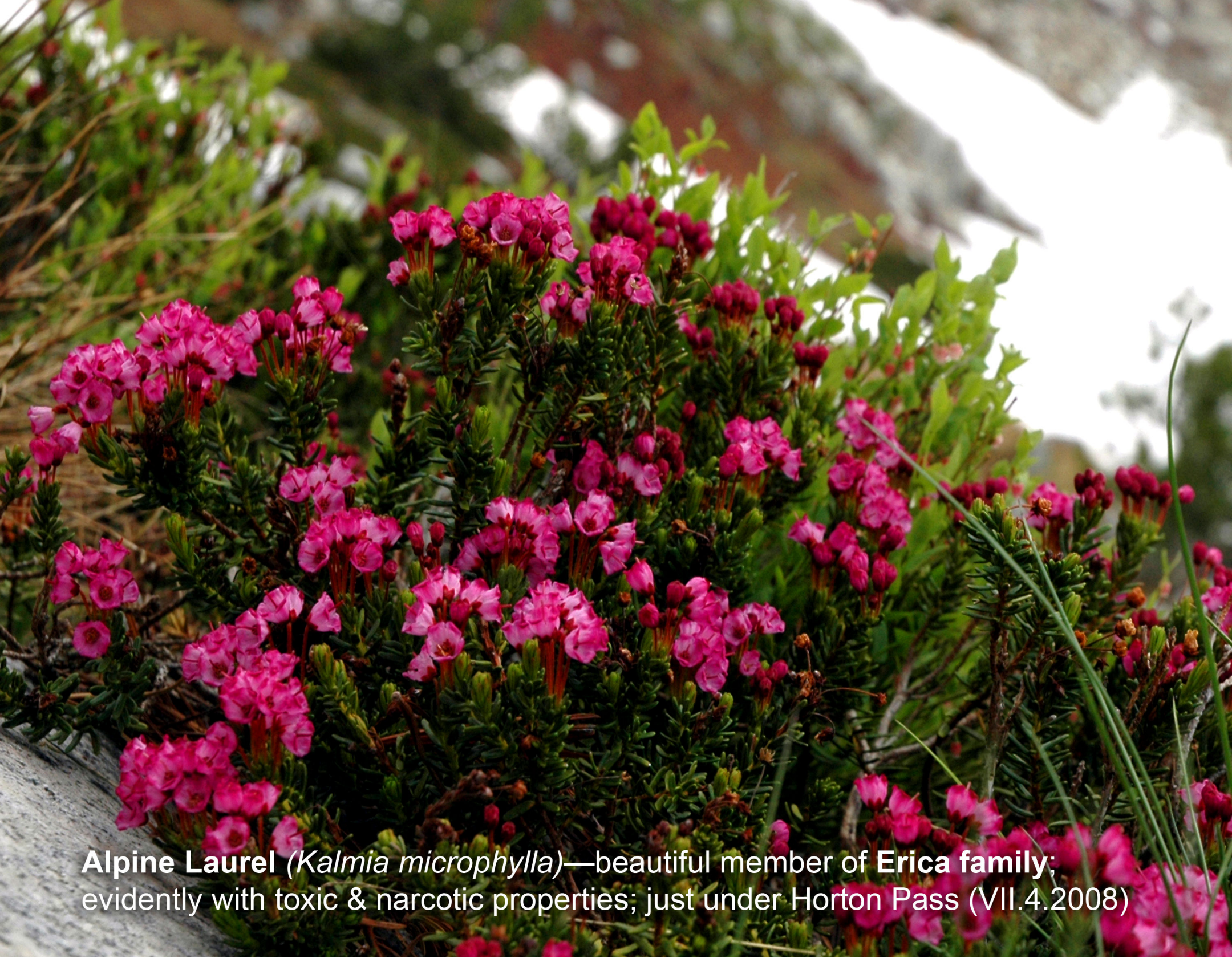
Alpine Laurel ( Kalmia microphylla ) —beautiful member of Erica family ; evidently with toxic & narcotic properties; just under Horton Pass (VII.4.2008)