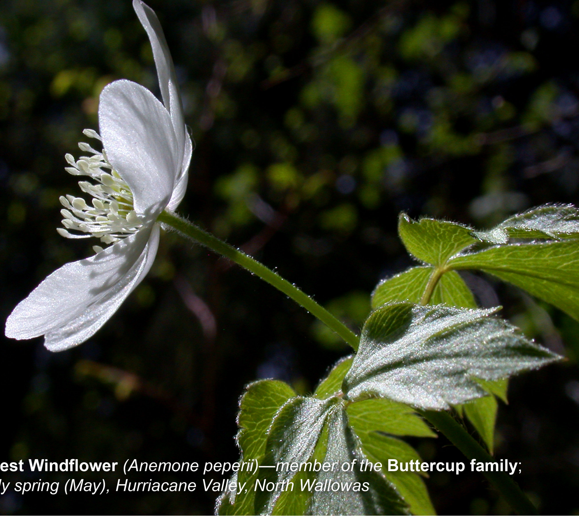
Forest Windflower ( Anemone peperi )—member of the Buttercup family; early spring (May), Hurriacane Valley, North Wallowas